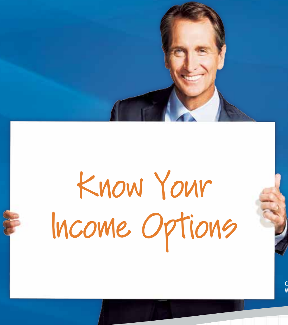
Cris Collinsworth Western & Southern Spokesperson

Put Your Retirement Income Plan in Action