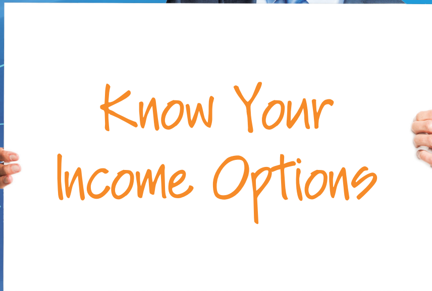
Cris Collinsworth Western & Southern Spokesperson

Put Your Retirement Income Plan in Action